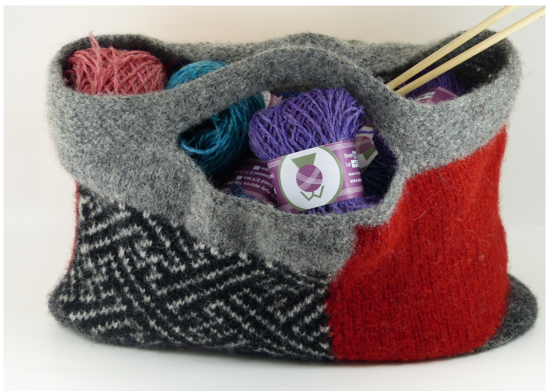
Shown in tudor, black, cream, charcoal and silver